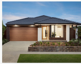
The New Haven 22 (Central Facade)

Ferntree Ridge Estate 15 King Parrott Blvd, Drouin, 3818