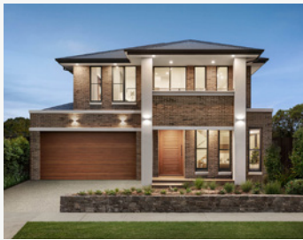
The Spinifex 38 (Chicago Facade)

Eliston Estate 11 Brickwood Street, Clyde, 3978