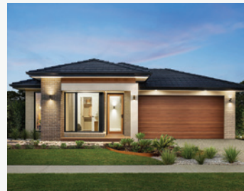
The Wave 22 (Pinnacle Mk1 Facade)

Visit: beachwood-homes.com.au for details.