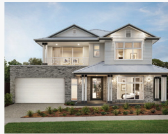
The Lorne 34 (Cape Facade)

Canopy Estate 17 Snead Blvd, Cranbourne, 3977