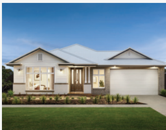
The Murray 25 (Cove Facade)

Kaduna Park Estate 1 Merbein Way, Officer South, 3809